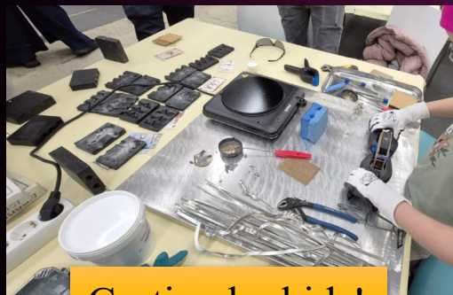
Casting by kids!

JÖNKÖPING UNIVERSITY School of Engineering